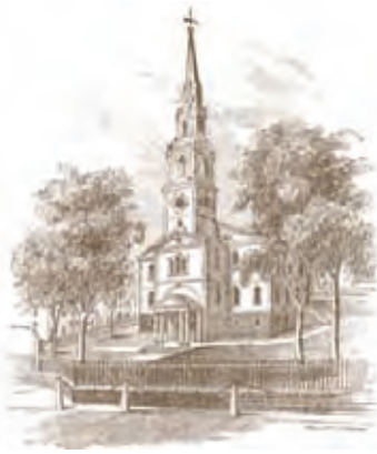
First Baptist Church, Providence, Rhode Island